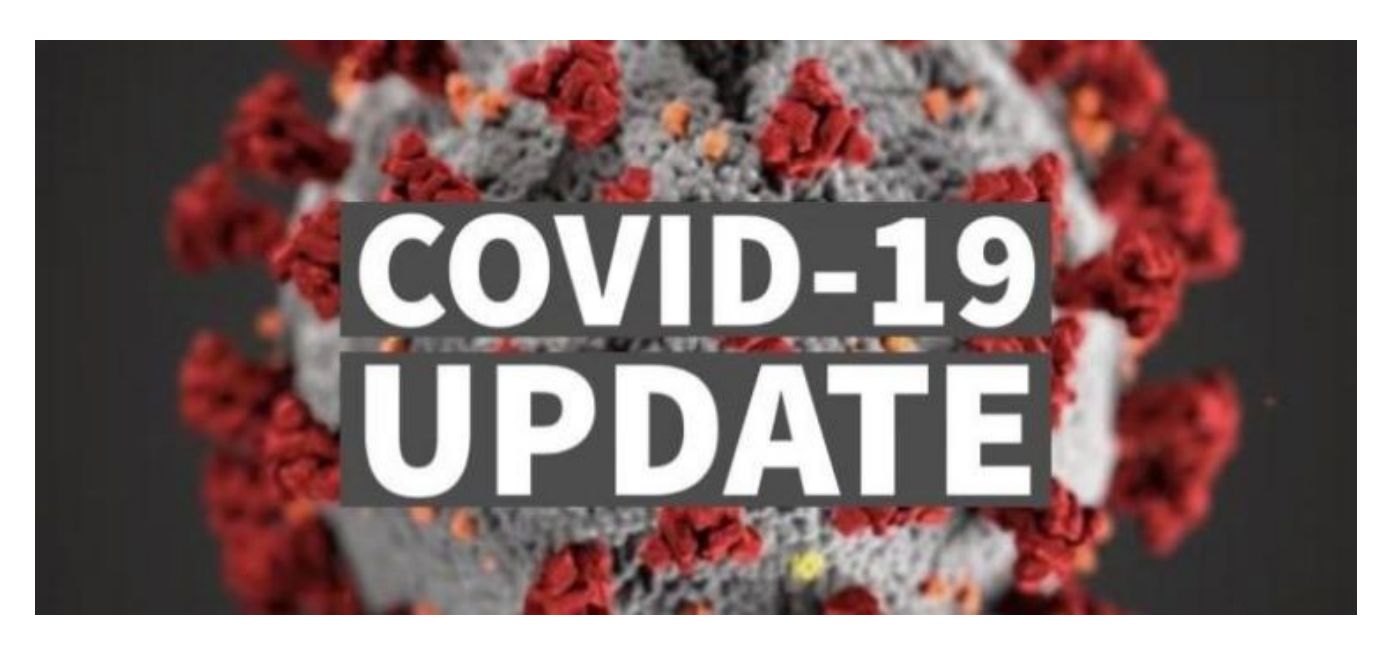
May 1, 2020 at 3:04 pm: Confirmed cases of Covid-19 in the area: